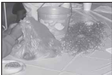
Below: The illusive Easter Bunny is caught on camera.