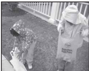
Left: Some of the kids make sure they keep track of each egg found.

The whole Chrysalis House family turned out for the annual Spring Party. This year's party not only included a great cook-out but also a visit from the Easter Bunny and very anticipated egg hunt.