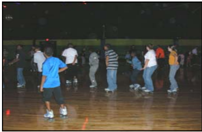
Above: Chrysalis Children enjoyed Skate Day at Champ's Roller dome in

The children of the clients at Chrysalis House receive a wide range of services to suit their special needs. Children of elementary school age are welcome at the After School Program and Summer Day Camp. Both programs