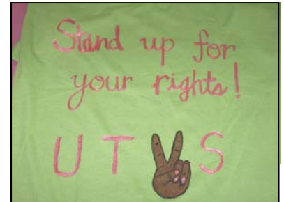
Above: A t-shirt designed by a Chrysalis House client for the "Until the Violence Stops" campaign, which Chrysalis House co-sponsored.

Chrysalis House implemented a Domestic Violence Program in 1999. A primary goal of the Domestic Violence Program is to help participants understand the dynamics of intimate partner violence so they can identify warning signs. A full-time DV coordinator oversees the program.